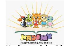
Kademy Sdn Bhd